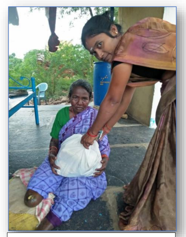
Support to an old woman with an amputated leg – Penakacherla village