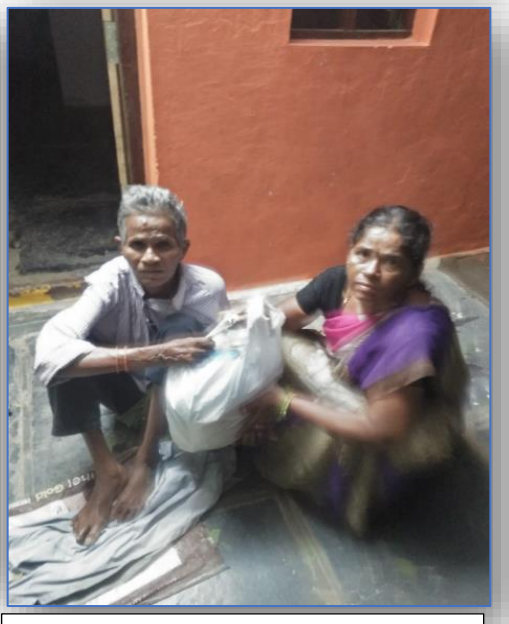
\label{eq:Support} \begin{tabular}{ll} Support to an old couple-A \\ medically unhealthy husband \end{tabular}