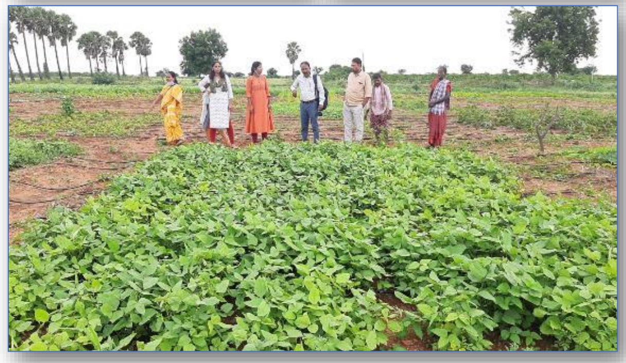
Visit of KVK, Rekulakunta team members to the FPO