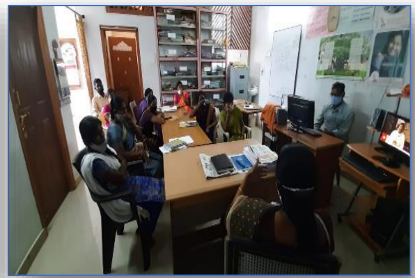
G.P. Level Trainings and meetings