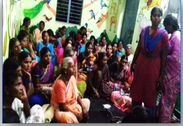
Evaluation Team with the BoD Members